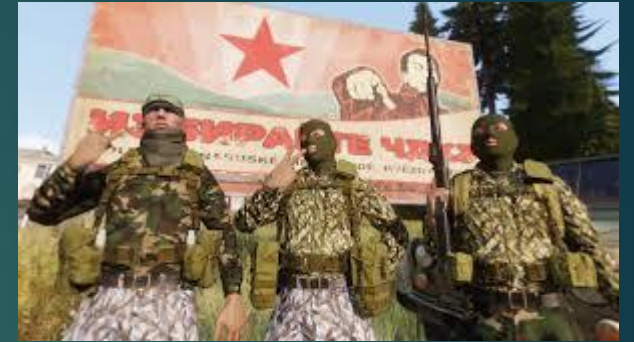
Members of the ChDKZ